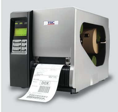
Value · Performance · Support